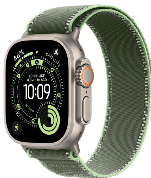
Apple Watch Ultra 3 GPS + Cellular