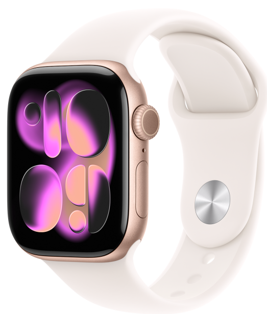
Apple Watch Series 11 GPS + Cellular, GPS