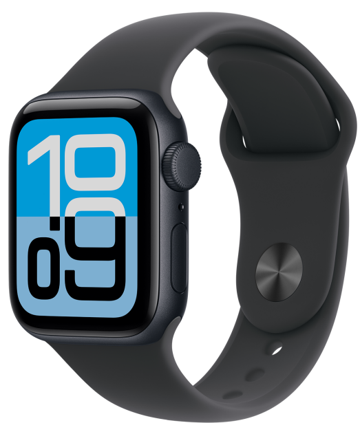
Apple Watch SE 3 GPS + Cellular, GPS

Designed for all workouts of all types, outdoor exploration, and water activities, Apple Watch Ultra 3 is the ultimate sports and adventure watch.